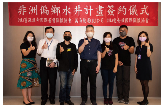
與萬海航運簽訂非洲偏鄉 12 口水井合作備忘錄